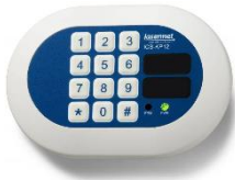
Glowing Green LED, F11 & F19

If you see this sign illuminated outside of a CAESR lab door, with both red and yellow parts glowing, you may NOT enter if you don't have LASER safety training. Press the doorbell button to ring for assistance from an active user or ask for assistance from the Scientific Applications Manager. A glowing red LED means the keypad works for trained LASER users.