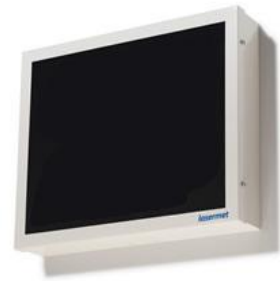
Without the red glowing part, you may enter.

Wenn die rote Warnleuchte nicht aktiv ist, darf das Labor betreten werden.