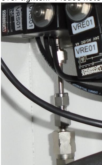
VRS01 valve and one-way valve.