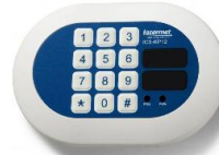
Absent Green LED, F11 & F19

如果您在 CAESR 实验室门外看到此标志亮起，红色和黄色部分都在发光， →则且 如果您没有接受过激光安全培训，则不得进入。按门铃按钮响铃以寻求 活跃当前 用户的帮助或寻求科学应用经理的帮助。 。 ——发光的红色 LED 表示键盘适用于经过培训的 LASER 用户。