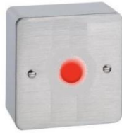
Glowing Red LED, rm F12