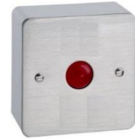
Dark Red LED, room F12